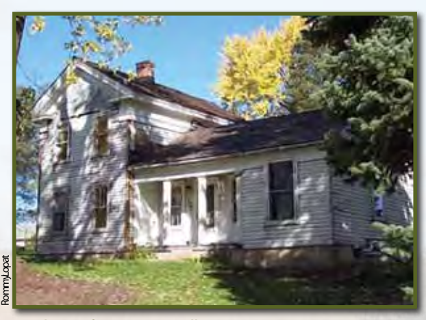
Residence of W.A. McConnell

Early plat maps show McConnell owning portions of what is now protected within the North Branch Conservation Area. Through multiple purchases, both the unique natural communities and the historical aspects of the site are being preserved.